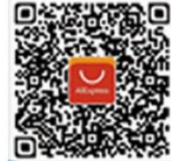
Aliexpress Store URL